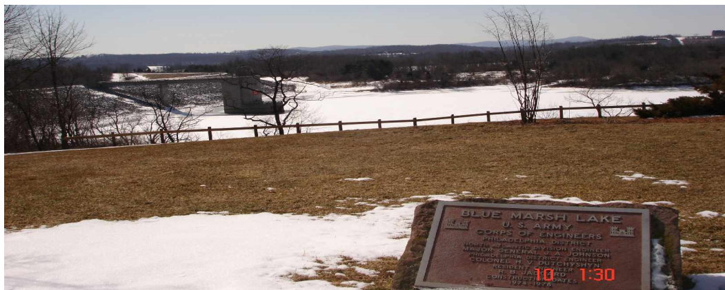
Technical tour of the Beltville & Blue Marsh Lakes

The next 28 th USSD Annual Meeting will be held in Portland (Oregon) on April 28 th ÷ May 2 nd , 2008.