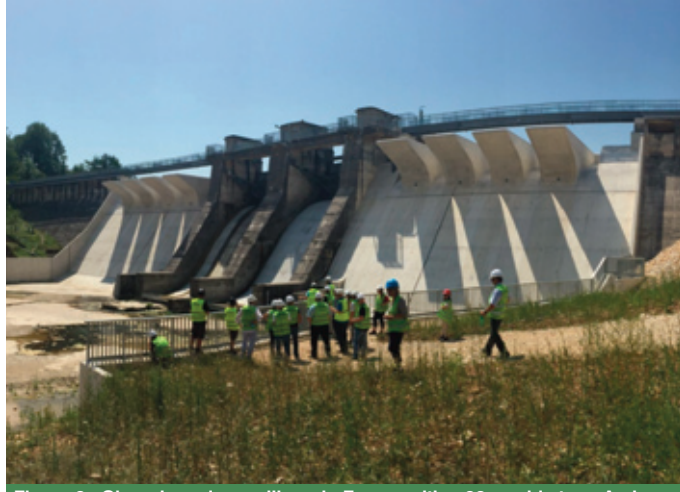
Figure 2. Charmines dam spillway in France with a 23 m wide type-A piano key weir section on both sides of the crest gates (PKW commissioned in 2015).

Spillways are key dam safety structures releasing excess water from reservoirs, in particular during floods. Weirs control the discharge through free flow spillways and corresponding reservoir levels. A high discharge capacity spillway allows for more reservoir water storage while keeping dam overtopping and other upstream flood related risks at acceptable levels. Since the discharge capacity of a weir is proportional to its crest length, engineers and scientists early on developed solutions to maximize this crest length [5] while responding to projects goals or sites limitations (restricted spillway width, project economics, etc.). In this respect, Labyrinth weirs, firstly formally studied in 1941 by Gentilini, place the crest of a thin vertical wall along a triangular, trapezoidal or rectangular path (in plan view) to maximize the crest length within a limited footprint (Figure 1). The number of Labyrinth weir projects increased exponentially after the publication of key research by the US Bureau of Reclamation and the American Society of Civil Engineers (ASCE) in the eighties and the construction of