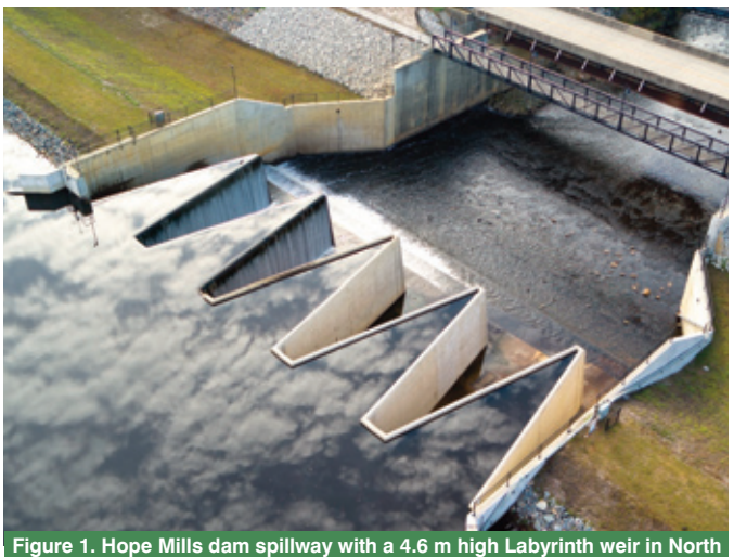
Figure 1. Hope Mills dam spillway with a 4.6 m high Labyrinth weir in North Carolina, USA (commissioned 2018).

Labyrinth weirs are an efficient solution for free surface flow whose development has been initially favored by a close collaboration between research and industry in the United States. Piano Key weirs improve the traditional Labyrinth concept and have been developed with the same collaborative spirit at an international level. Both structures have a huge potential of development and application worldwide, which has been exploited yet only in a few countries.