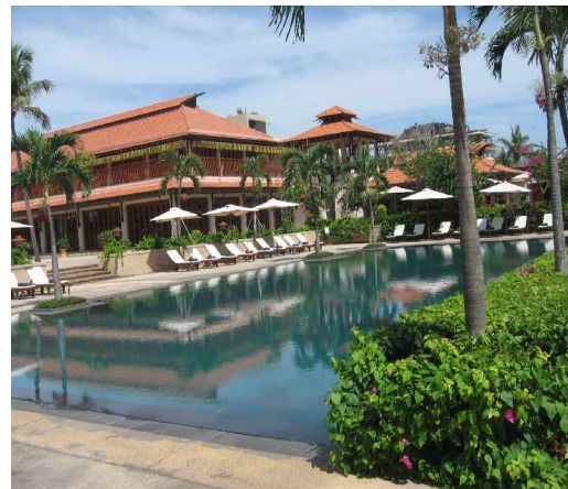
Furama Hotel – Da Nang City