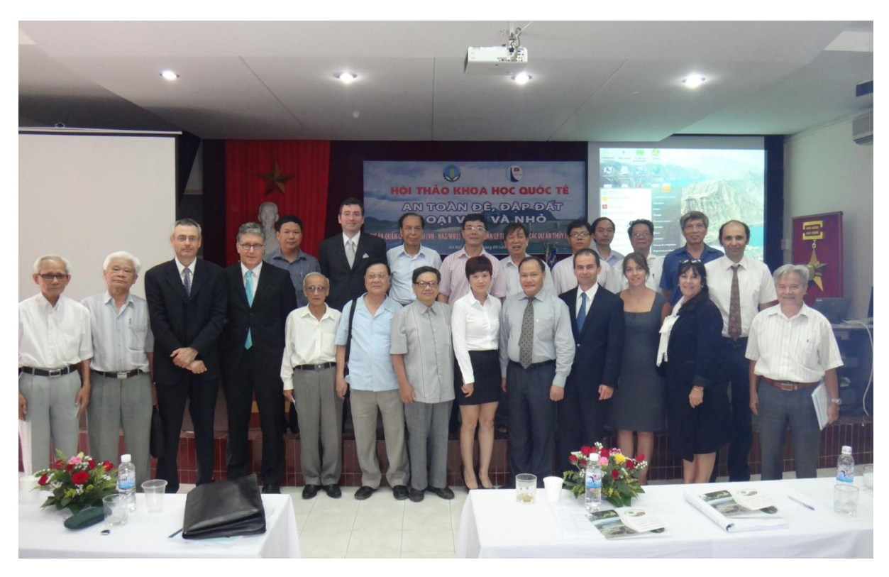
In memory of the Seminar