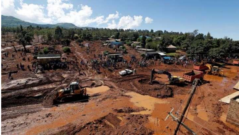
Photo in Left: Kenyan emergency workers have found three more bodies after a dam burst last week, police said Monday, bringing the toll from the tragedy to 48, while authorities confirmed no one else was missing